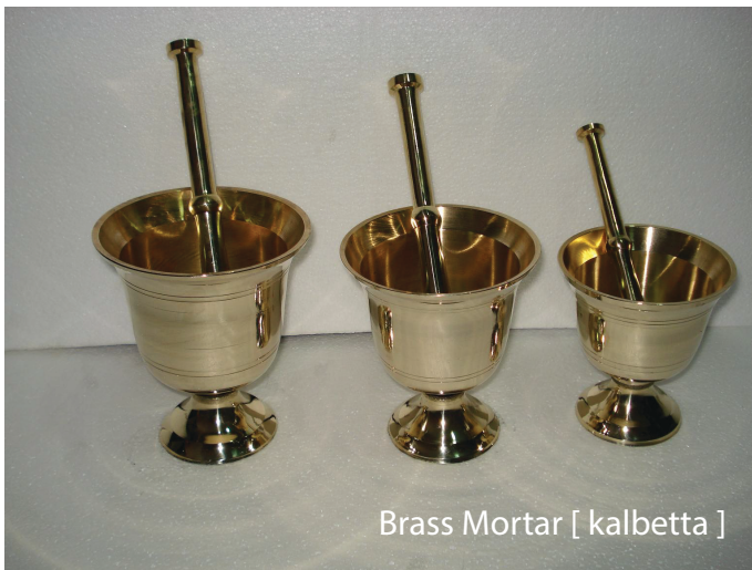
Brass Mortar [ kalbetta ]