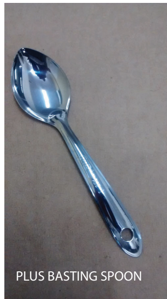
PLUS BASTING SPOON