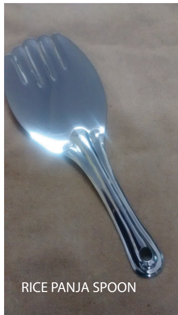
RICE PANJA SPOON