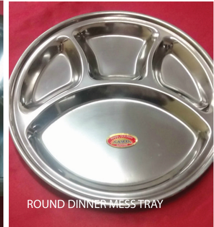
ROUND DINNER MESS TRAY