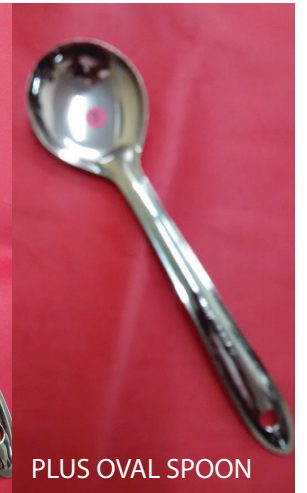
PLUS OVAL SPOON