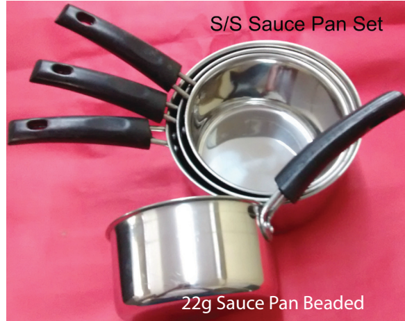
S/S Sauce Pan Set