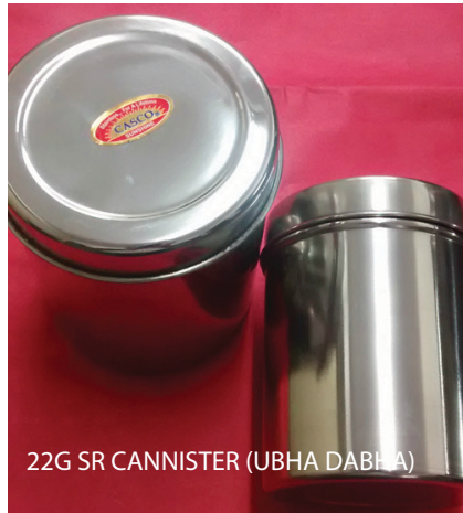
22G SR CANNISTER (UBHA DABBA)