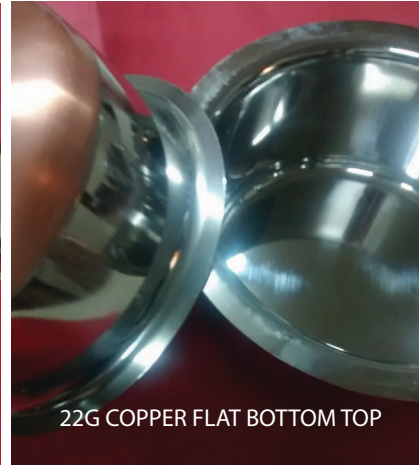
22G COPPER FLAT BOTTOM TOP