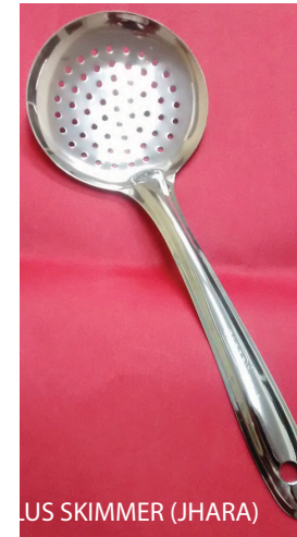
PLUS SKIMMER (JHARA)