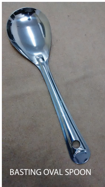
BASTING OVAL SPOON