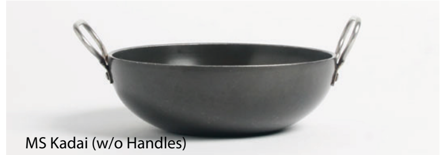
MS Kadai (w/o Handles)