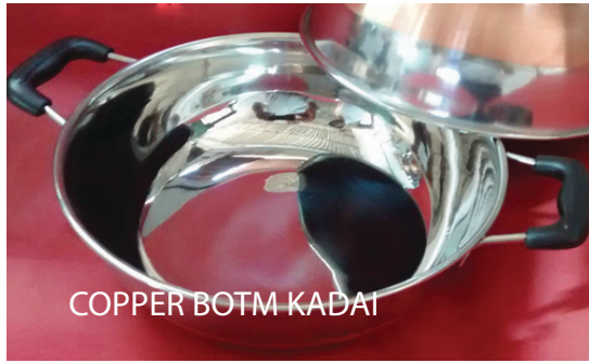
COPPER BOTM KADAI