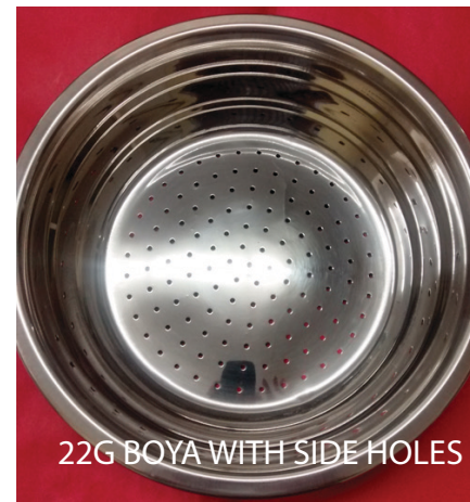
22G BOYA WITH SIDE HOLES