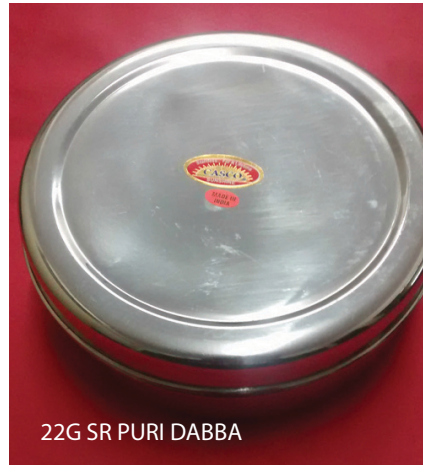
22G SR PURI DABBA