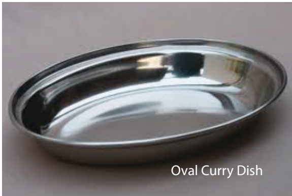
Oval Curry Dish