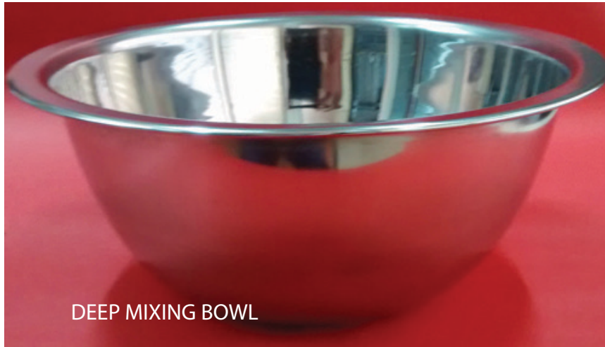
DEEP MIXING BOWL